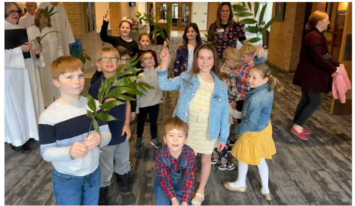
Palm Sunday processional was so much fun for the kids!