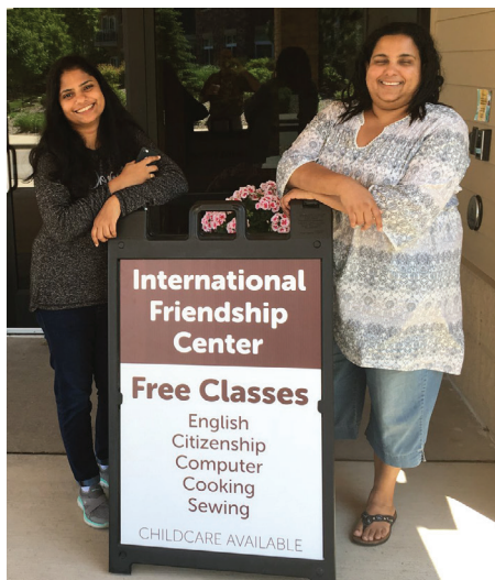
Free classes are offered through POBLO.