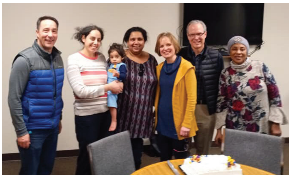
Join other Cross View members to support the POBLO International mission right here in the U.S.