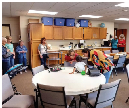
Cross View members volunteer during a cooking class.